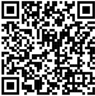
Feasibility Study Survey